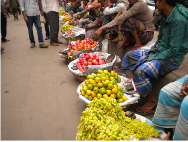
Footpath Business Bhaban