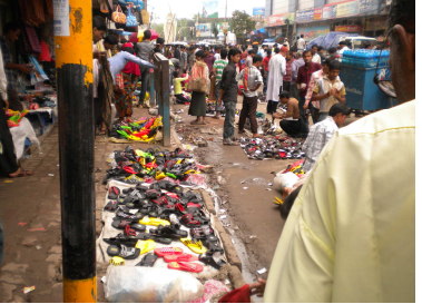
A road that affected by footpath